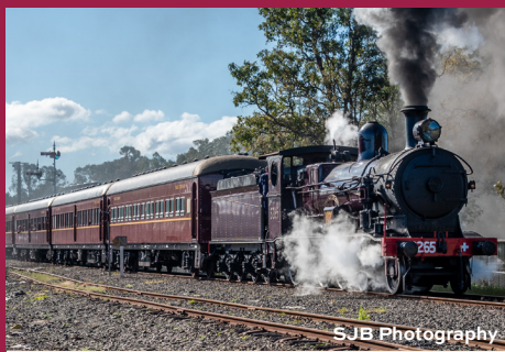
LOCOMOTIVE 3265 THE HUNTER Entered service – 1902