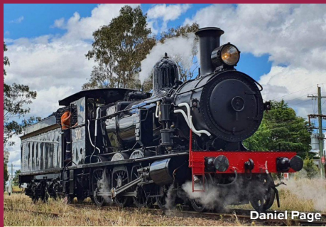
LOCOMOTIVE 3001 SYDNEY'S SUBURBAN LOCOMOTIVE Entered service – 1903

Just some of the locomotives in steam either on display or operating at this year's Festival.