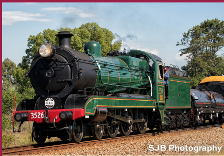
LOCOMOTIVE 3526 THE NANNY Entered service – 1917