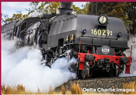
LOCOMOTIVE 6029 THE GARRATT Entered service – 1954